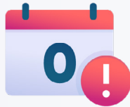
Zero Day threat defence