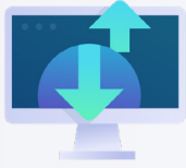
File uploads or downloads from unknown source