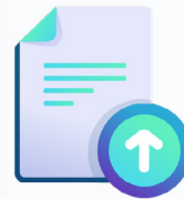
Internal upload of files between a trust boundary