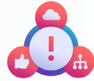
Malware risk removal